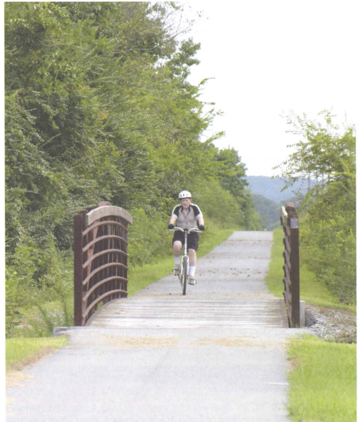
Closing the eight mile gap between the trails are four renovated bridges that cross over Terrapin Creek.

For more information on the city of Anniston please visit www.ci.anniston.al.us/ , or for more information on the Rails-to-Trails Conservancy, please visit www.railstrails.org . □